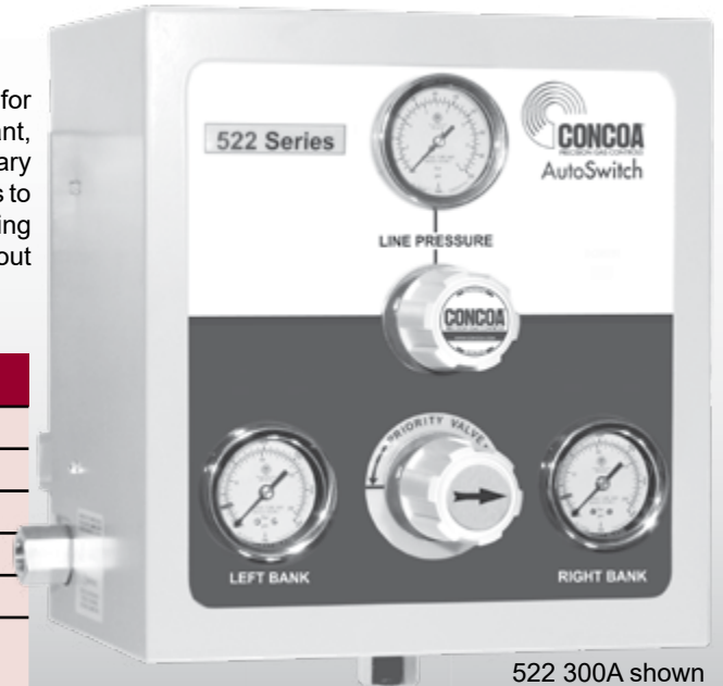
522 300A shown

The 522 Series AutoSwitch is a continuous gas delivery system for high purity gas service, typically in the laboratory or process plant, that automatically changes cylinder or bank priority from the primary source to a reserve supply without transmitting pressure fluctuations to the use line. Options include internal pressure switches with warning lights for cylinder depletion or internal pressure transducers without warning lights. Both may be used with an Altos alarm.